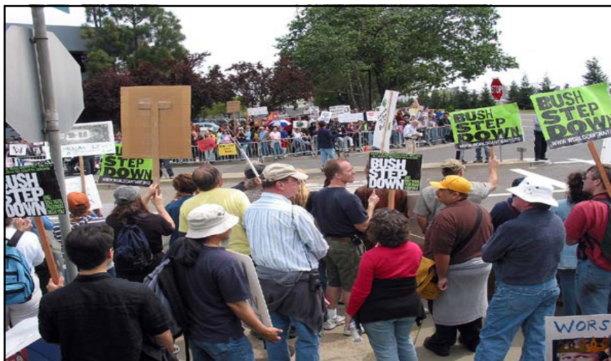
Hundreds of protestors, including many T&Cers, gave George Bush a hearty welcome during a recent visit to West Sacramento.