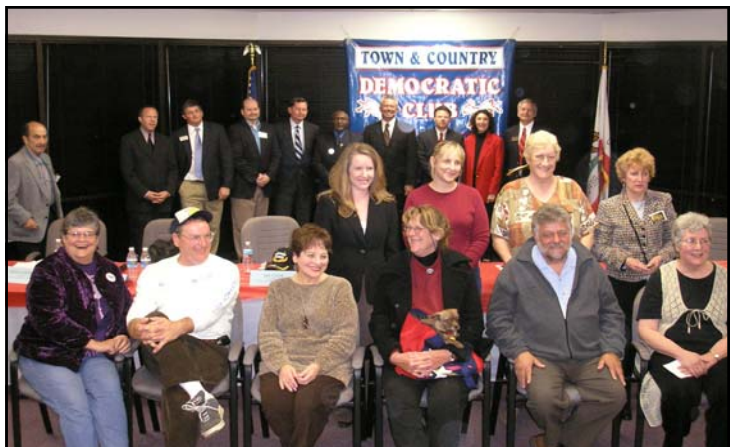
Democratic candidates for 2006 gathered for a photo op at T&C Candidates Forum in April. About 140 attended.